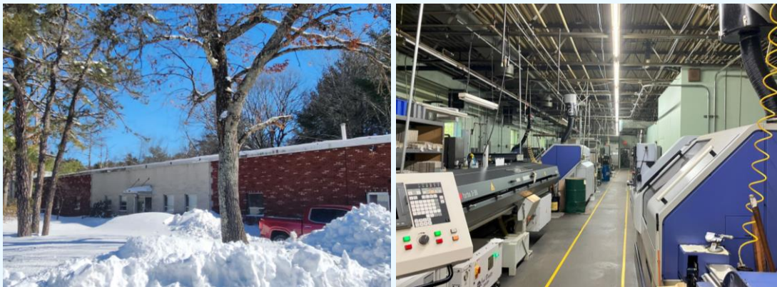
▲ Acra Cut / Intech Headquarters