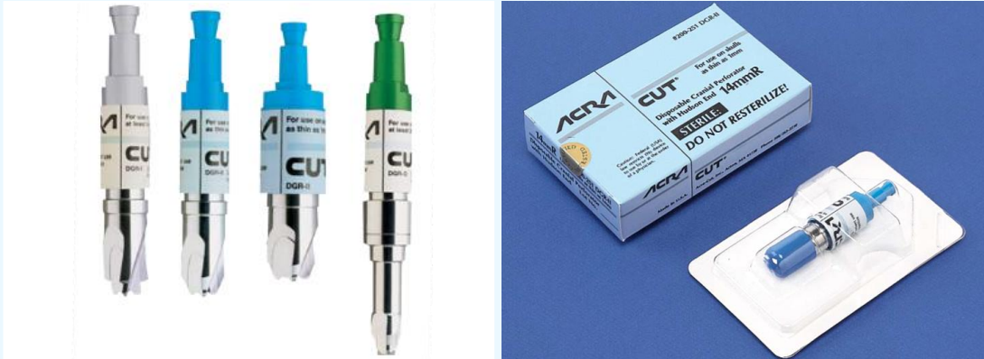
▲ Cranial Perforator